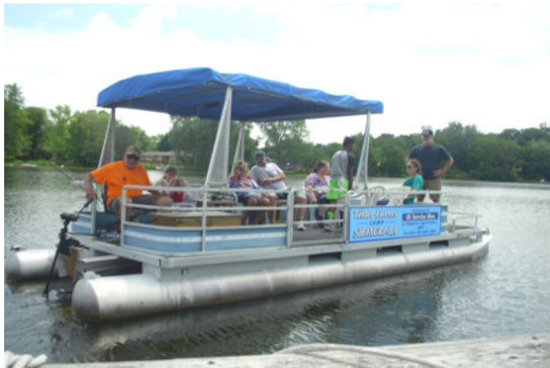
A group goes out on a ride on our pontoon boat at Kelly Lake this year