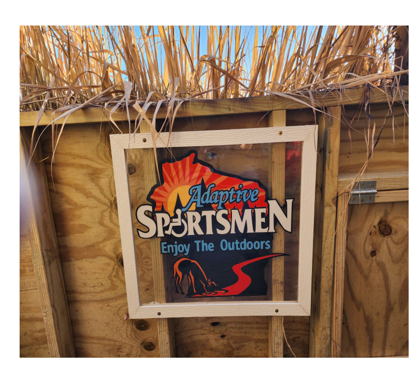
This is the sign Cal received while running the booth at DeerFest. It is now in the accessible blind in the Jackson Marsh. It can be used for waterfowl, deer or turkey

I was lucky enough to get drawn to hunt at Badger Mine Co during the disabled gun hunting season. They have afew locations throughout the state. This buck showed up but it was walking straight away then at 100 yards it finally tuned to allow me to see the vitals. Lucky enough to drop him where he stood. He ended up being a 9 pointer that scored 155" and weighed 265 pounds. Cal Popp