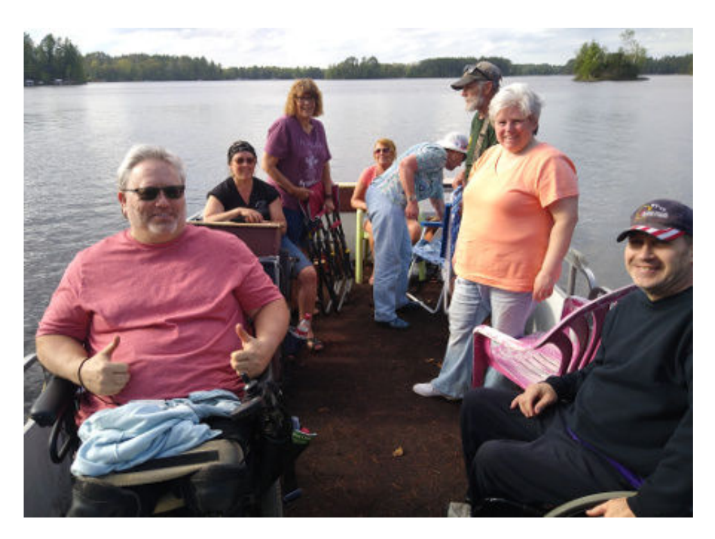
Part of the Northwoods Adventure group on the Pontoon Boat ready to take a slow tour of Spider Lake in Mercer