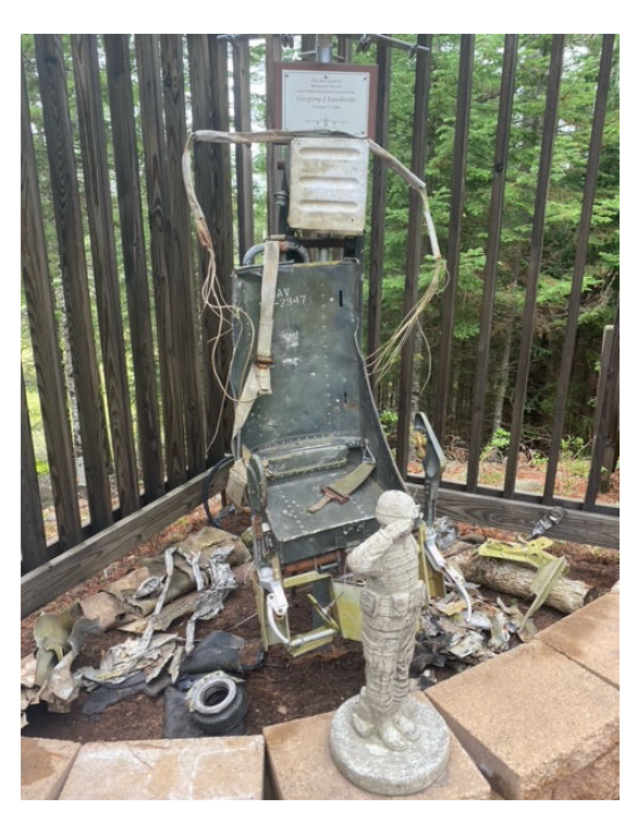
Memorial plaques and display at the 1961 B-47 plane crash site north of Mercer. See article in newsletter for more information.