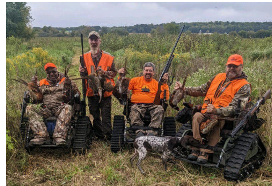
The hunters at the Feather Ridge Pheasant hunt show off some of the birds they shot.