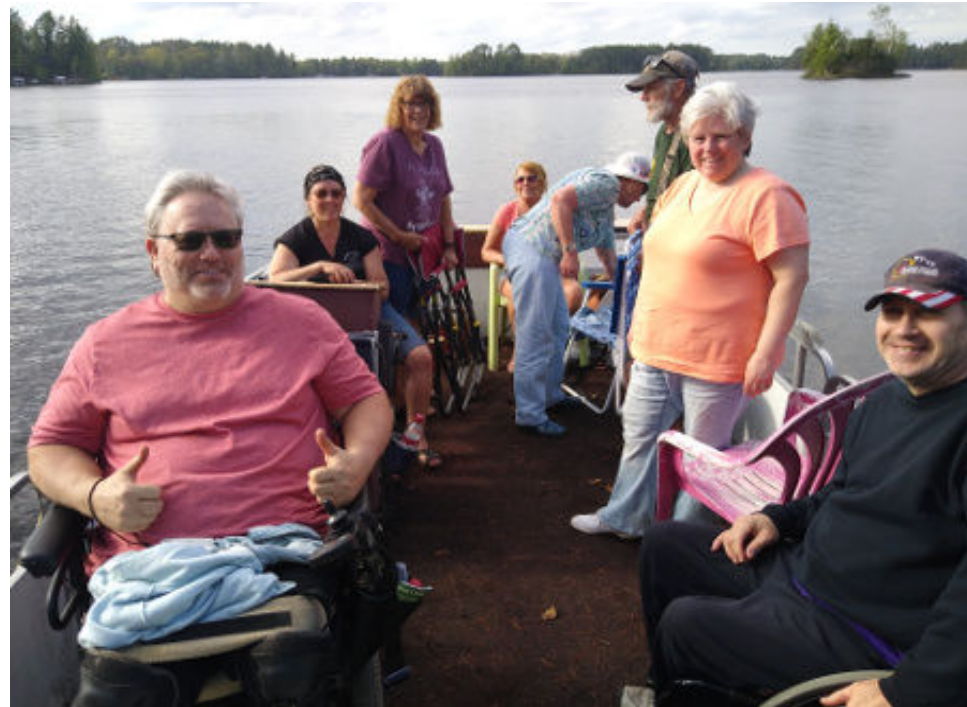
Part of the Northwoods Adventure group on the Pontoon Boat ready to take a slow tour of Spider Lake in Mercer