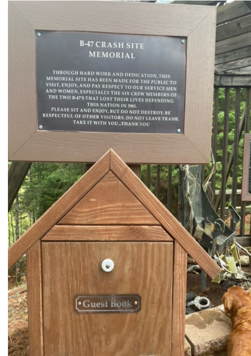
Memorial plaques and display at the 1961 B-47 plane crash site north of Mercer. See article in newsletter for more information.