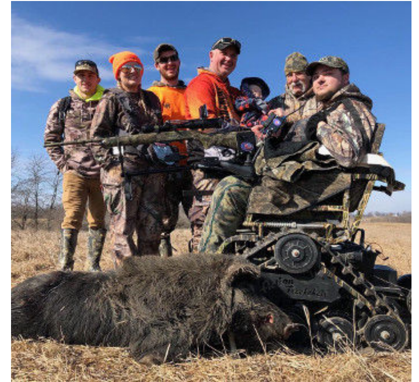
Group photo and nice hog shot in Iowa fall 2018 (above)