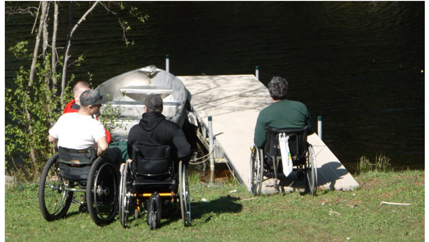
Fisherman going onto the pier at Spider Lake (above) Pontoon boat riders enjoy the lake view of Spider Lake in the evening (below)