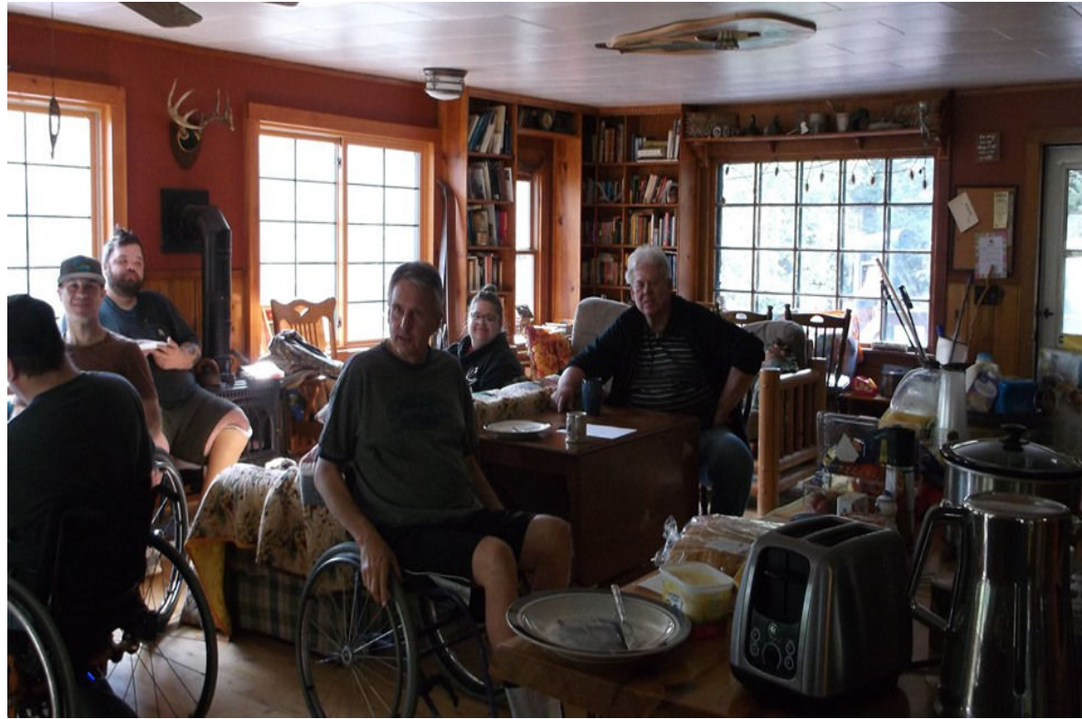
Northwoods Adventure group relaxes at lodge before supper (above) ATV riders get ready to ride on Friday morning (below)