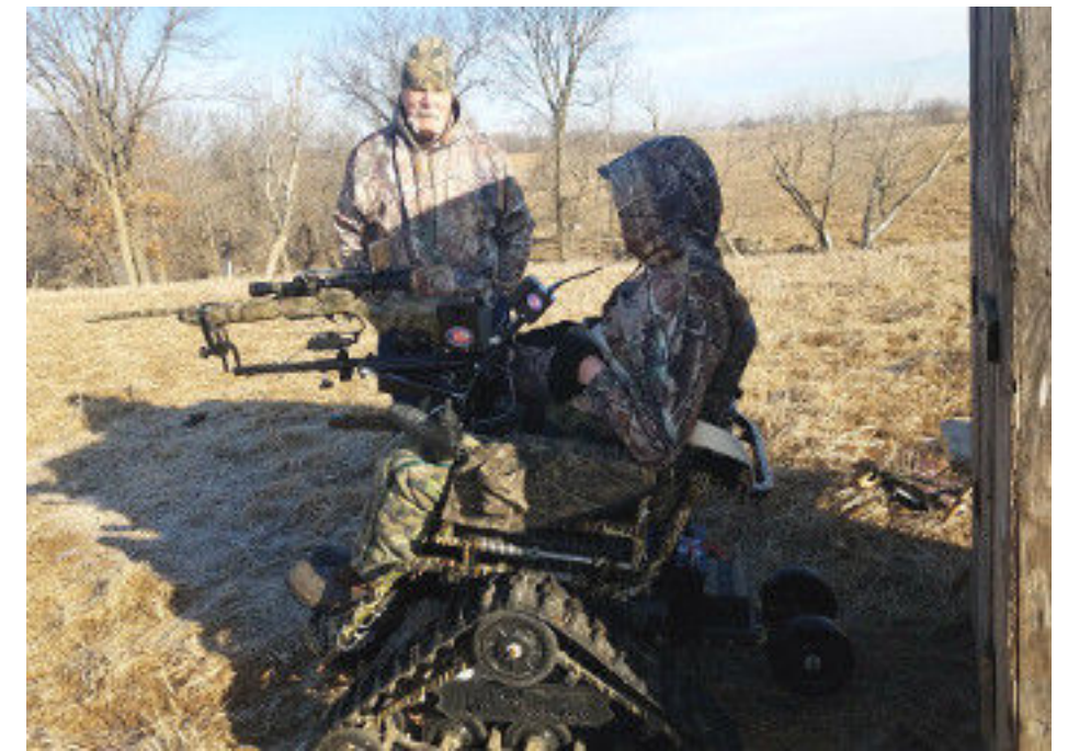
Hunter getting ready to hunt hogs, fall 2018 (below)