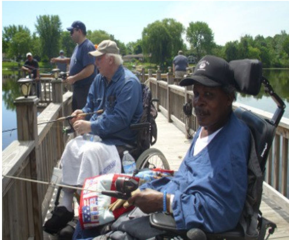
Veterans from the VA came out to fish at the Pier (above) Trap shooters try their luck at the range during the Schultz Summer Picnic (below)