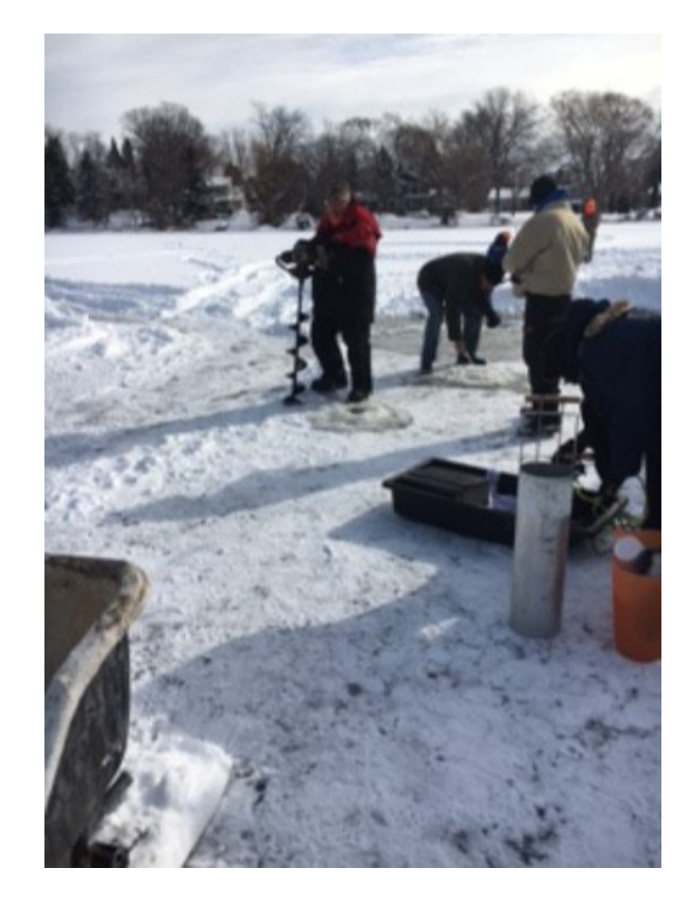
A volunteer drills one of the fishing holes (above)