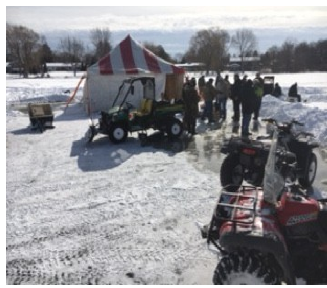
Activity around the tent as members prepare to start ice fishing (above) A view of the fishing activity from the shore (below)