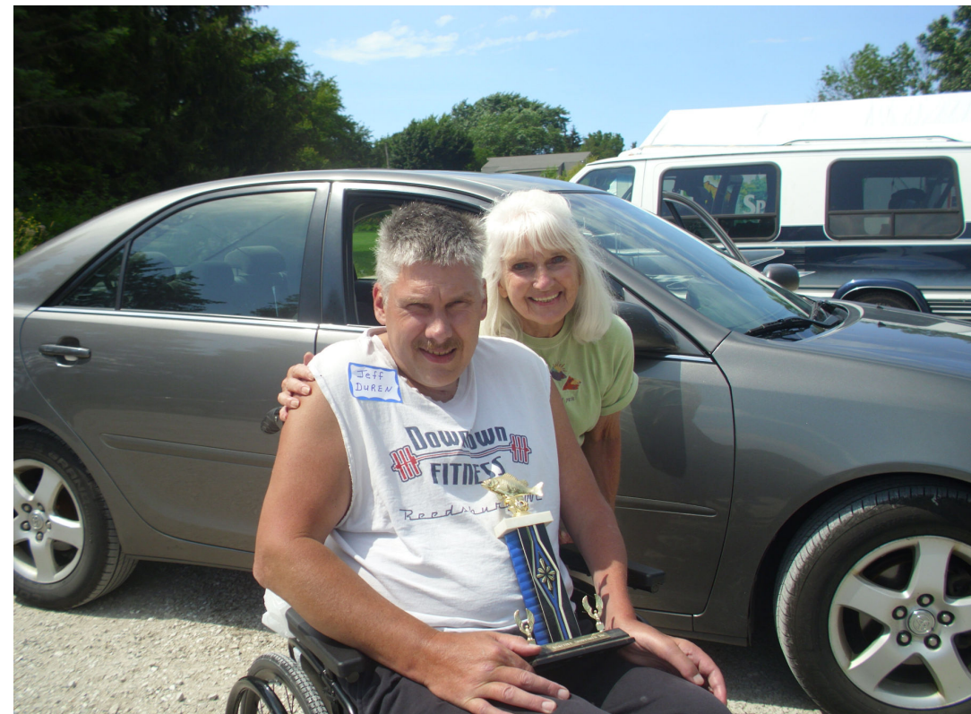
Kelly Lake awards and catch