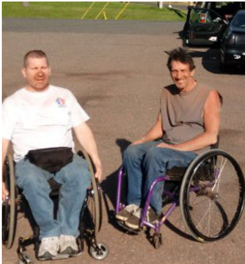
2017 ATV ride in Mercer Wisconsin