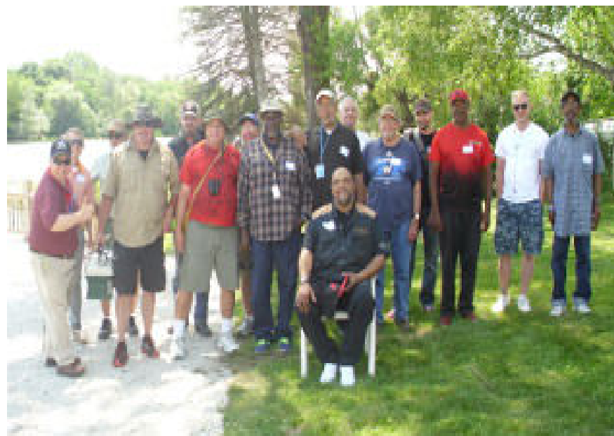
Kelly Lake picnic 2017