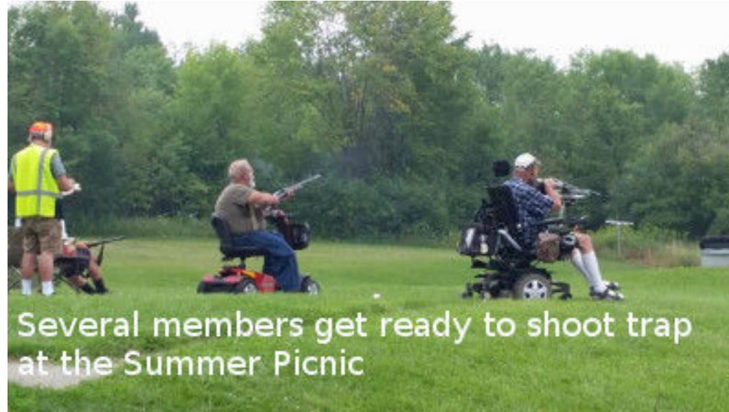
Several members get ready to shoot trap at the Summer Picnic