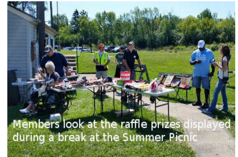
Members look at the raffle prizes displayed during a break at the Summer Picnic