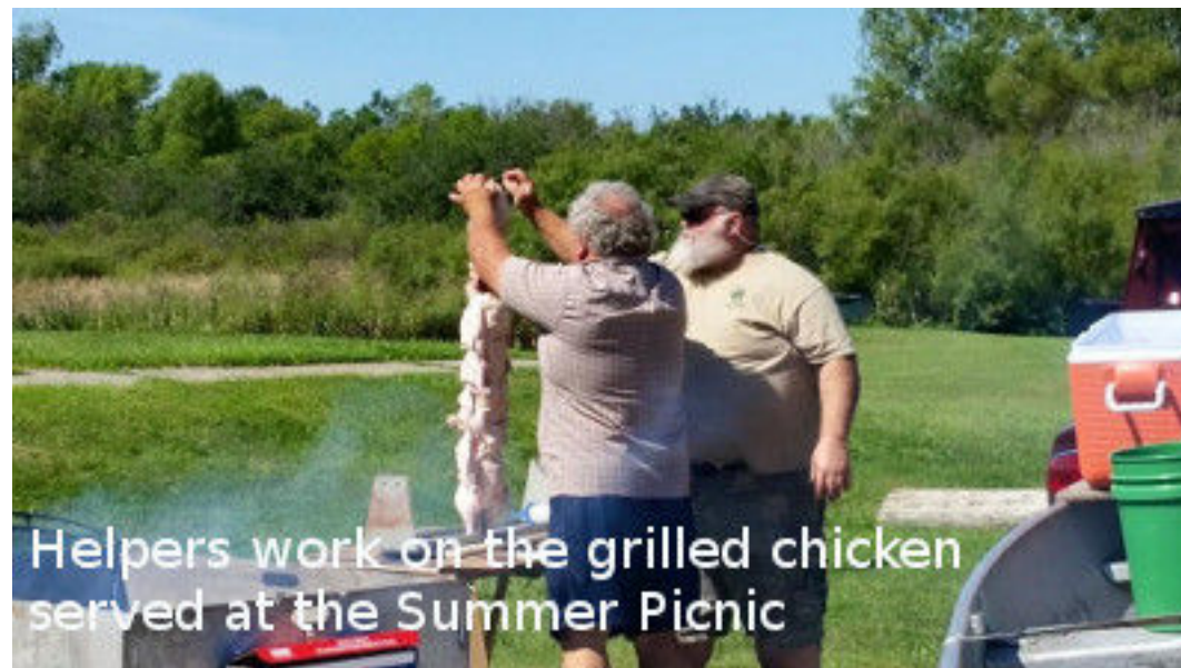
Helpers work on the grilled chicken served at the Summer Picnic