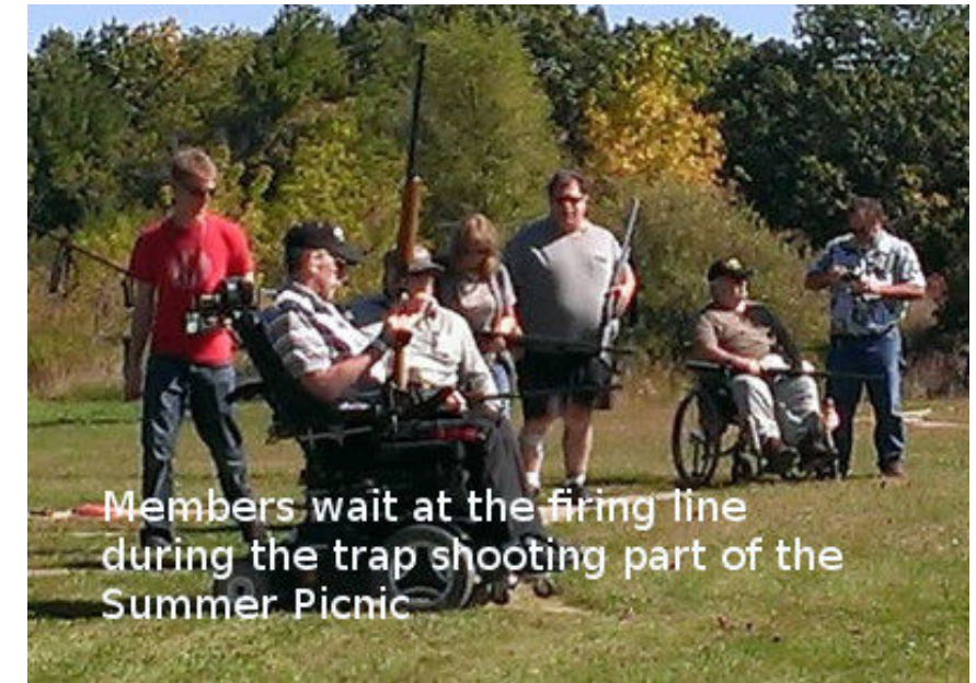
Members wait at the firing line during the trap shooting part of the Summer Picnic