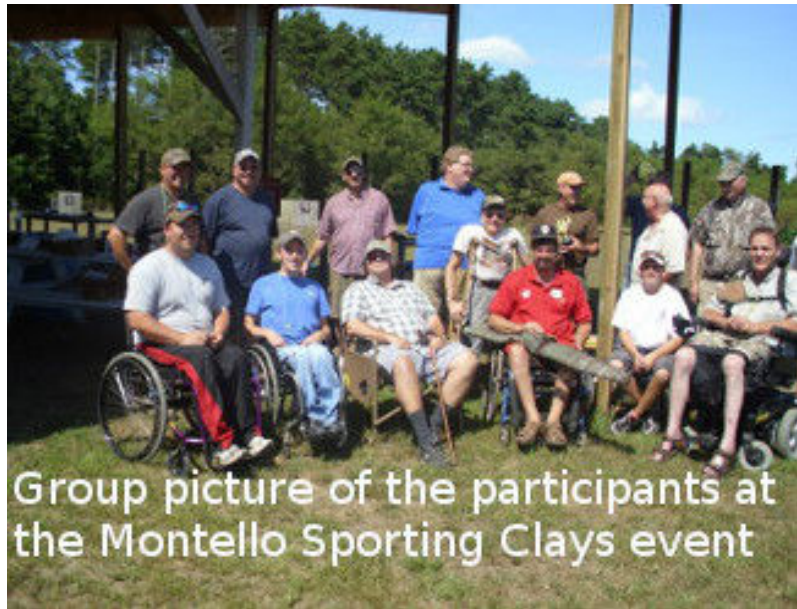
Group picture of the participants at the Montello Sporting Clays event