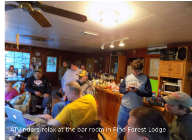
ATV riders relax at the bar room in Pine Forest Lodge