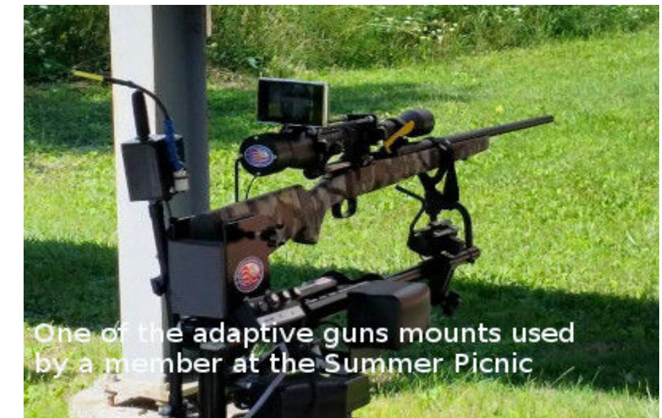
One of the adaptive guns mounts used by a member at the Summer Picnic