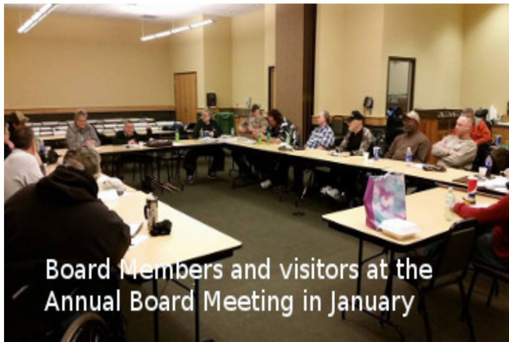
Board Members and visitors at the Annual Board Meeting in January