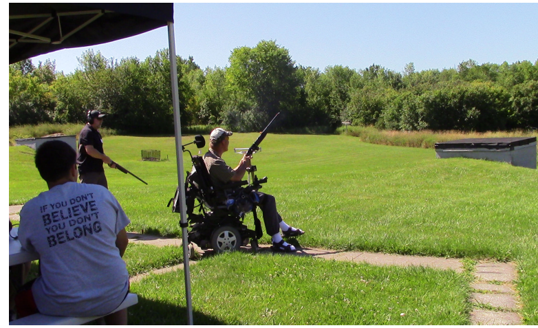
Many people tried out their hand at the trap shooting range during the Shooting Picnic.