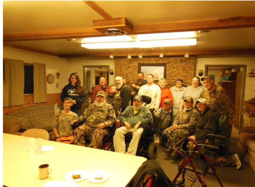
Group picture of the Clintonville hunting crew and support people