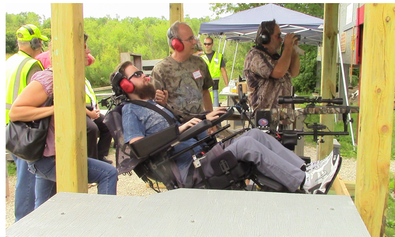
Many people tried out the rifle range at the Shooting Picnic and we had several talented volunteers to help out.