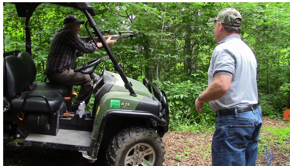
Many techniques were tried out during the 3-D archery shoot in Horicon