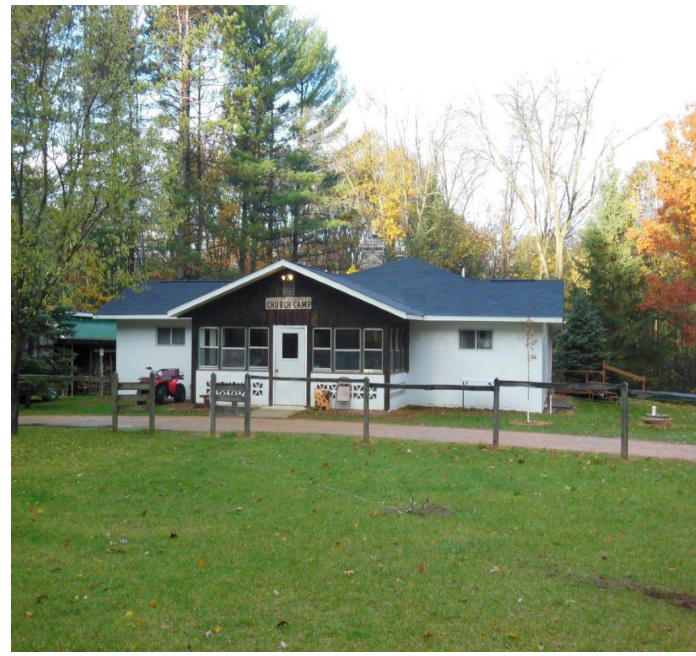
Hunting Lodge used at the Clintonville hunt this year