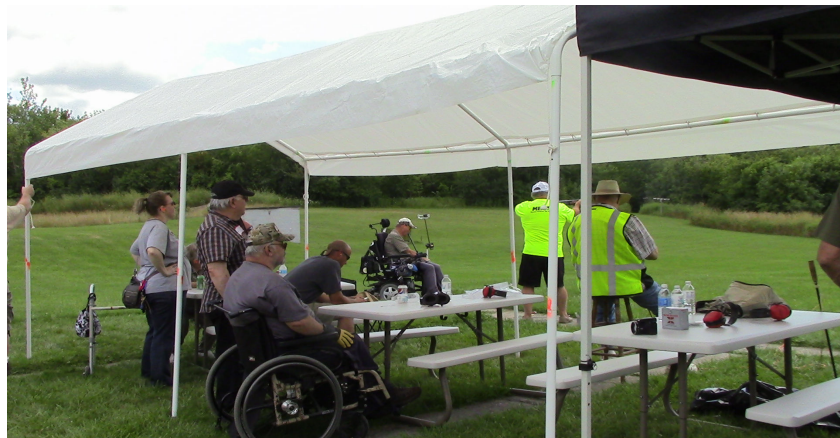
The trap range was a busy place during the Shooting Picnic