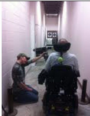
A disabled vet and helper on the crossbow range at West Town during our monthly archery event