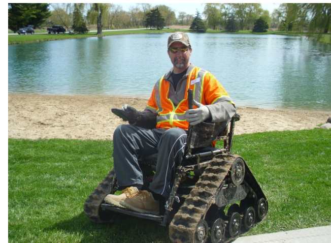
Trackmaster brought out two of their off-road tracked wheelchairs for our members to try out. They have been very supportive of our efforts to show our members the equipment available to get disabled sportsmen back into the outdoors.