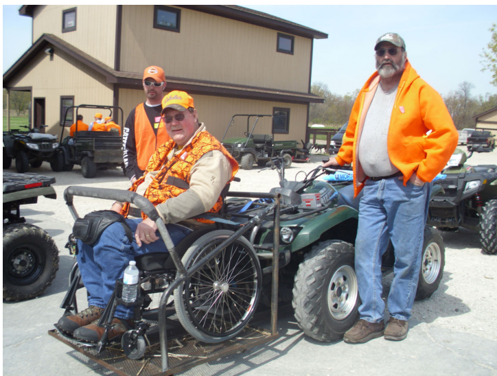
Here is one of the many ways that the volunteers at Halter got our members out in the field to hunt the pheasants. This homemade lift attaches onto the front of an ATV and makes it easy to get around in the tall grass and fields.