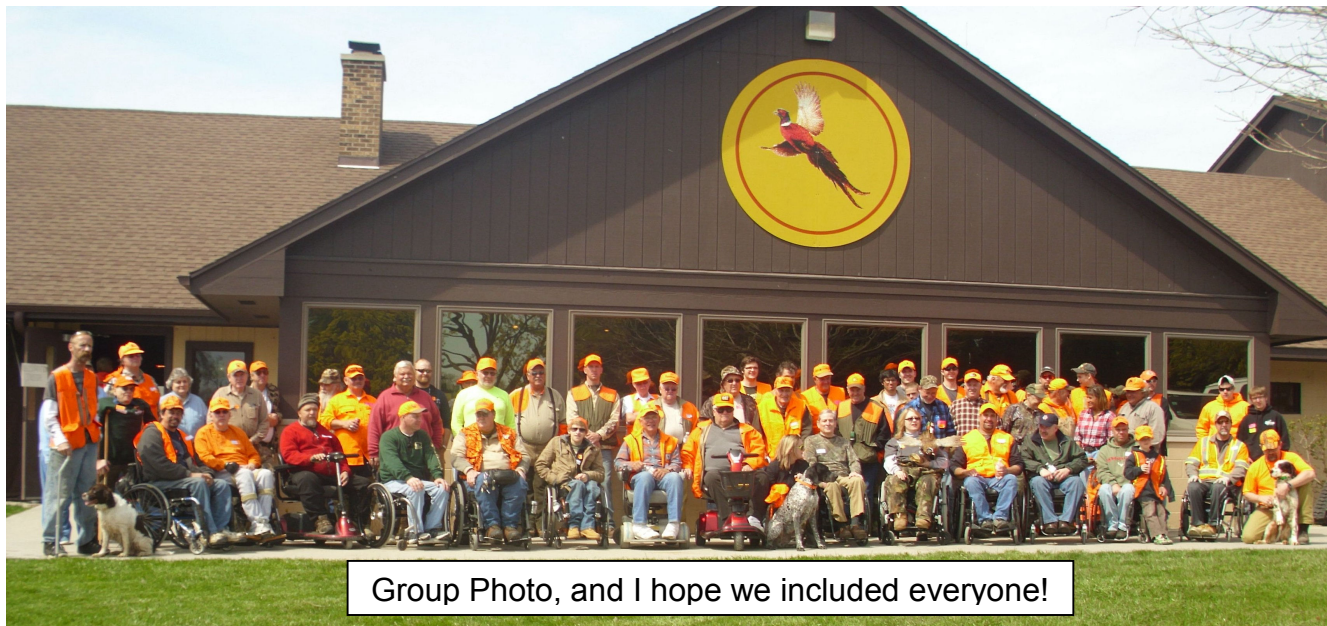
Group Photo, and I hope we included everyone!