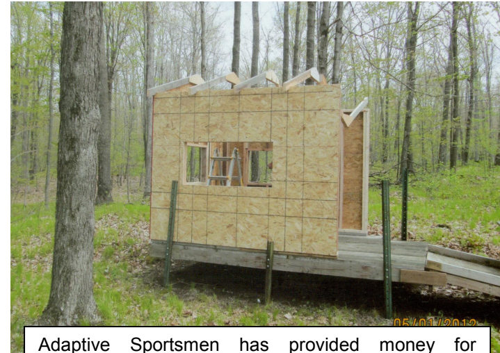
Adaptive Sportsmen has provided money for materials for this new ground blind being set up by Al Lamovec at his property near Willard, Wisconsin. Al has been working hard to set up a disabled youth outdoor camp, called Wisconsin Adventures on Wheels. We are proud to help him provide outdoor opportunities for disabled youths in Wisconsin.